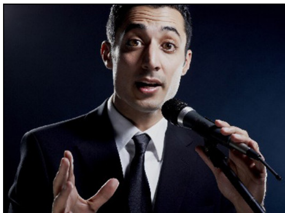
Dr Riaad Moosa

Riaad Moosa, who began his comic career performing at children’s parties, is one of South Africa’s most popular, award-winning and successful comedians; and he happens to be a qualified medical doctor as well!